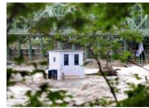
Nature's relentless fury