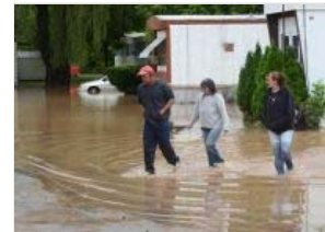
Record flood in Binghamton leaves 'dire' situation