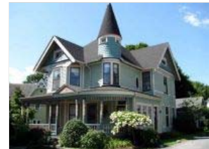
House of the Week: Victorian in Voorheesville